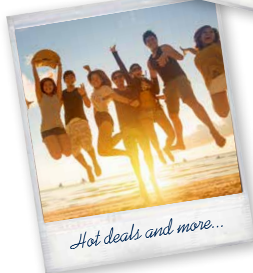
Hot deals and more...