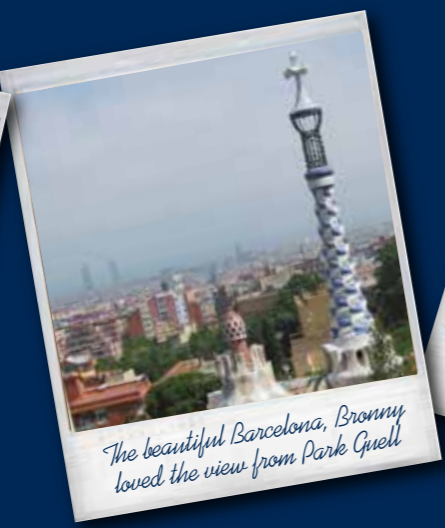
The beautiful Barcelona, Bronny loved the view from Park Guell