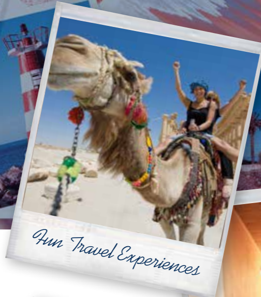
Fun Travel Experiences

Visit www.peregrinetraveladelaide.com.au/OurUnforgettableWorld to find out more!